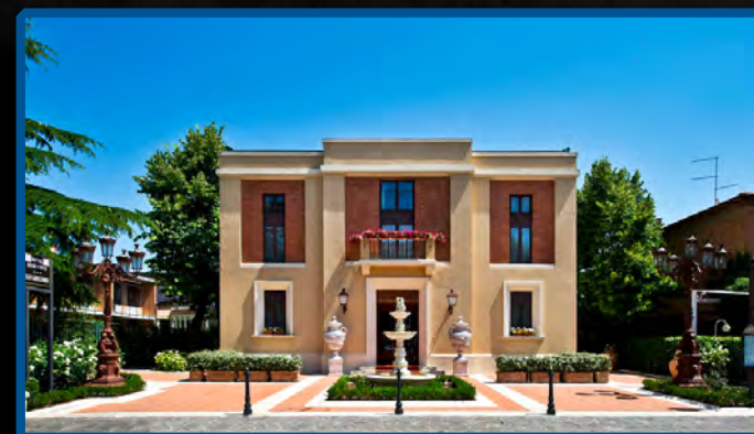
HOTEL SAN GREGORIO - PIENZA, ITALY OVERNIGHTS OF MAY 19, 20, 21, 22