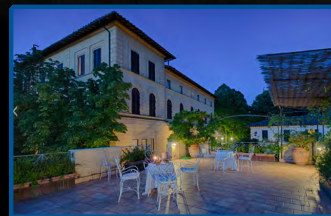
VILLA SCACCIAPENSIERI - SIENA, ITALY OVERNIGHTS OF SEPTEMBER 27, 28, 29, 30